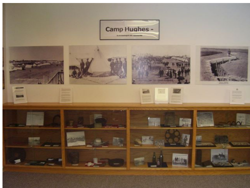
Exhibit at Carberry Library

The Museum houses the largest known collection of artefacts from Camp Hughes of which some of it is on exhibit within the museum and the rest is in the study collection in the storage area. A satellite site is on display at the Carberry Town Library containing 4 exhibit cases of artefacts at Hughes.