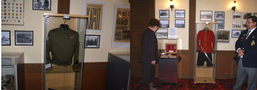
Royal Winnipeg Rifles Exhibit