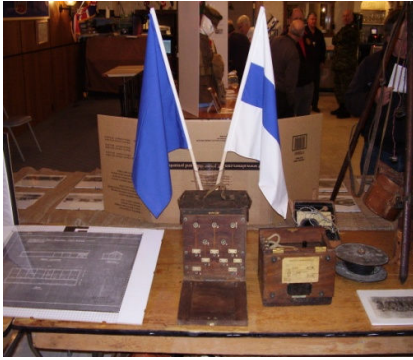
Signal Exhibit Hughes Heritage Day November 08, 2008