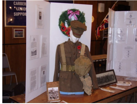
Hughes Heritage Day November 8, 2008