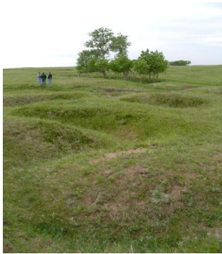
Trench at Camp Hughes 2008