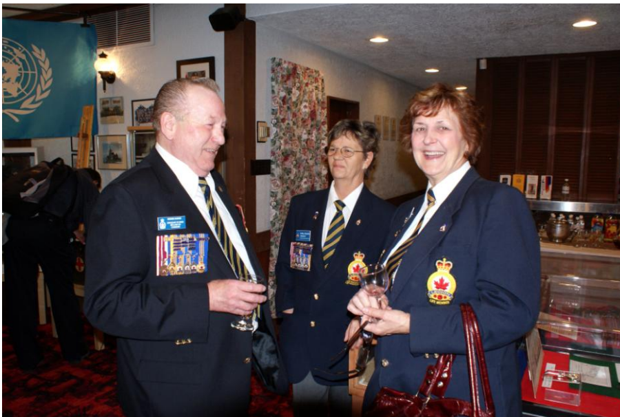
Members of The Royal Canadian Legion